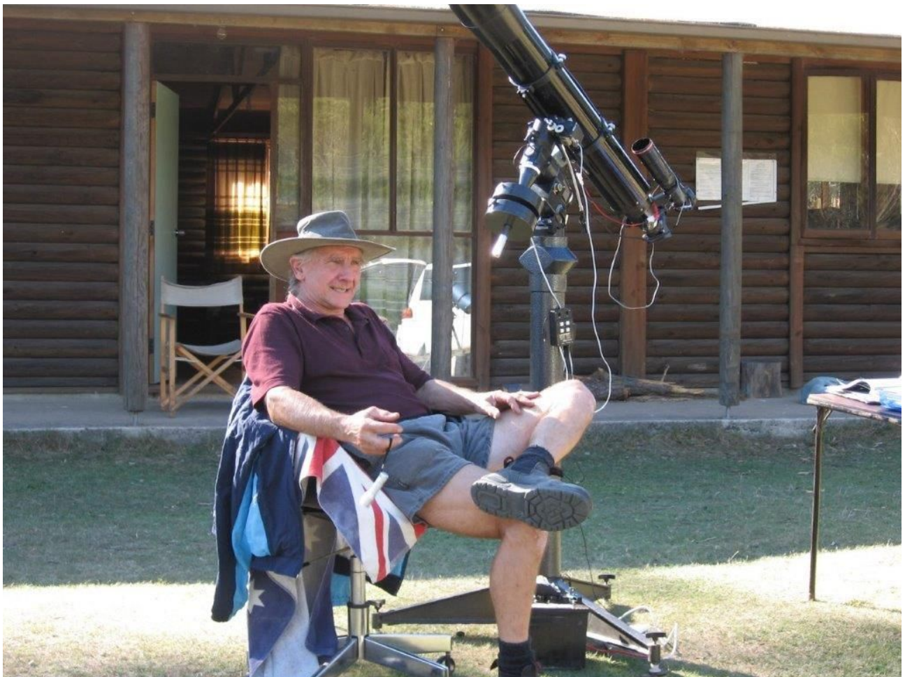
Waiting for sunset at The Forest cabin.