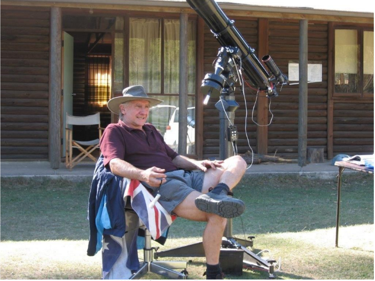
Waiting for sunset at The Forest cabin.